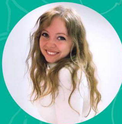
VANESSA ERVIN CCX booklet designer, Photographer