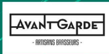
AVANT GARDE Beers for the Bar