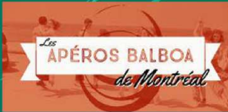
APÉRO BALBOA MONTREAL Saturday Bal event