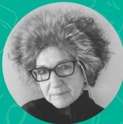
NOURIT MASSON SÉKINÉ Drawing of figures